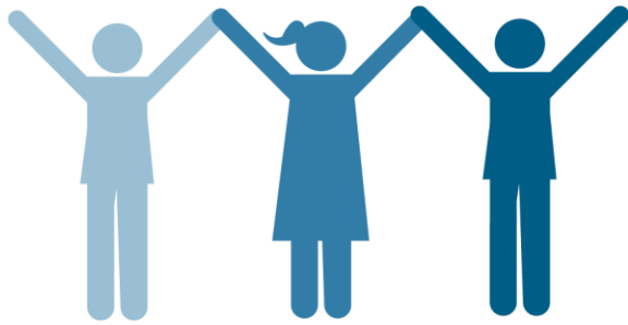
Public Confidence in Self-Regulation