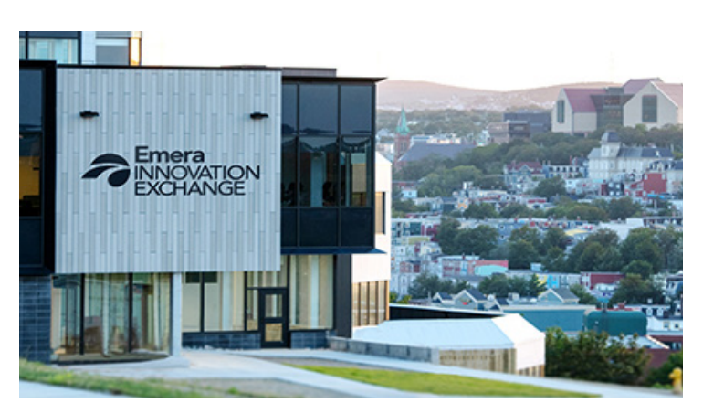
The 68th Annual General Meeting was held at the Emera Innovation Exchange Conference

For further details see RegulatioN Matters - Summer Edition