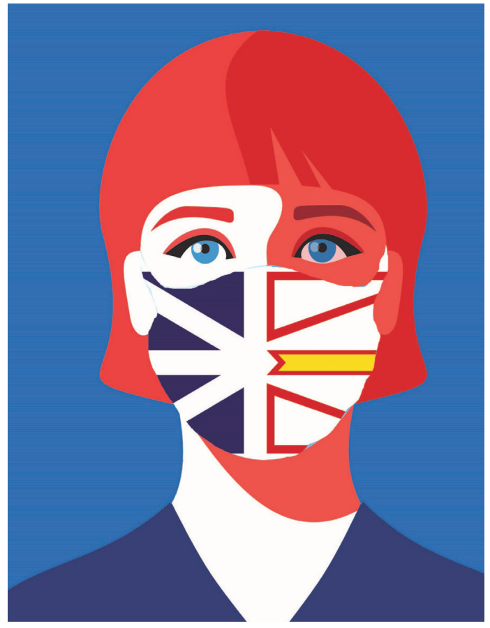
2020 has impacted the lives of all Newfoundlanders and Labradorians, most notably the RNs and NPs of our province.

Prior to the public living in a new reality whereby words such as "quarantine", "isolation" and "social distancing" became a part of the vernacular, the College approached the Provincial Government in February and permanently changed the provincial regulation as to issue emergency licences to recently retired nurses. The purpose of such a change was to create a surplus of RNs who would be ready, willing, and available to assist in the event that our health care system became overburdened by the impact of the virus.